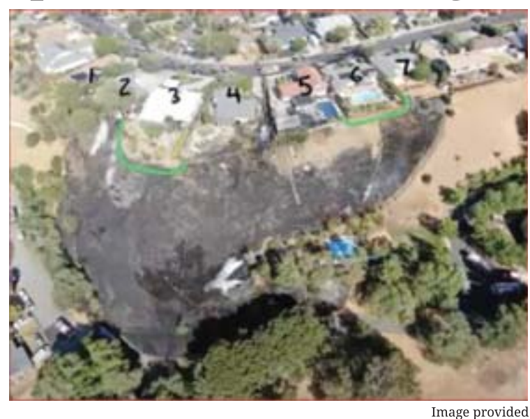
Fire service preparation and planning made a difference in 2020, when fighting brush fires like this one